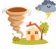
SEVERE STORMS & TORNADOS