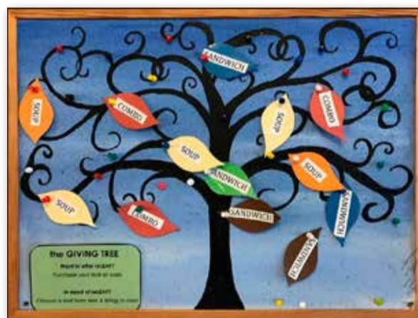
The "Giving Tree" at Higher Grounds Espresso Bar allows customers to purchase meals and drinks in advance for those in need in the Morinville community.

One of the café's most visible symbols of this spirit is its "Giving Tree," where each leaf represents a donated meal or drink available to those in need. It serves as a quiet but powerful reminder that care for