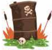
HAZARDOUS MATERIAL RELEASE