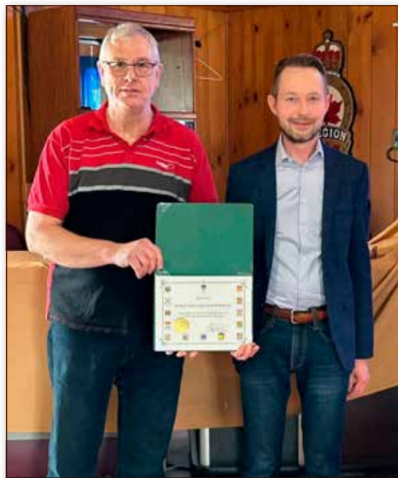
Honouring 80 years of service and community impact, Member of Parliament Michael Cooper joined The Royal Canadian Legion, Morinville Branch 176, on April 25 to celebrate its 80th anniversary and recognize decades of dedicated support for Veterans, commitment to remembrance, and contributions to the Morinville community. The milestone event underscored the Branch's enduring legacy and the important role it continues to play in honouring those who have served.