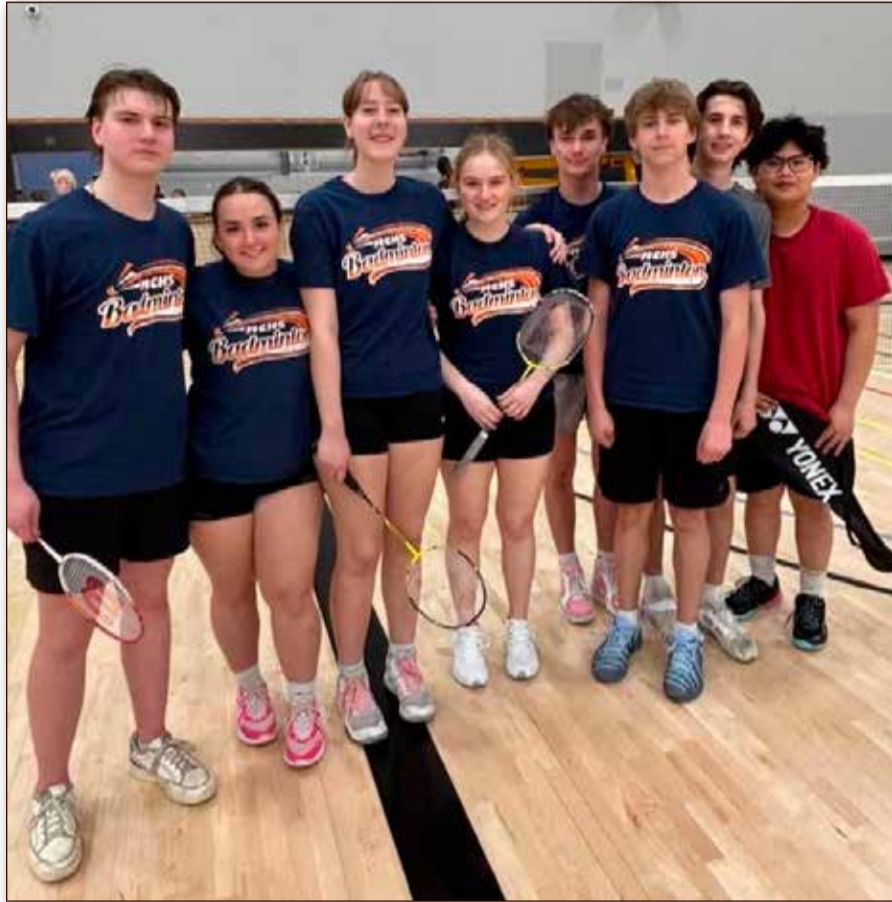
The Morinville Community High School senior badminton team gathers for a photo during the North Central Zone tournament, where they represented the school on and off the court.