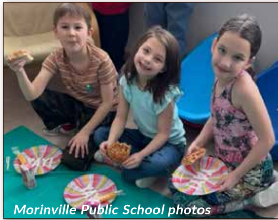
Morinville Public School photos

Throughout the week, Morinville Public School organized a variety