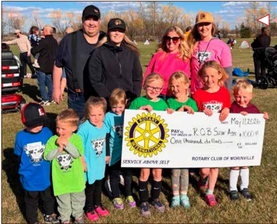
Members of the Rotary Club of Morinville joined local families and young athletes during a recent presentation supporting youth recreation initiatives in the community. The club donated $1,000 to the Rivière Qui Barre Fun Team Soccer Association on May 11 to help support youth sports and wellness programs.