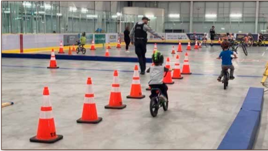
Young riders make their way through a cone course during the 2026 Bike Rodeo held at the Morinville Leisure Centre on May 7. The event focused on teaching bicycle safety, control and confidence-building skills ahead of the summer riding season.

worked their way through riding courses and skill stations that challenged them to practice balance, control and safe riding techniques.