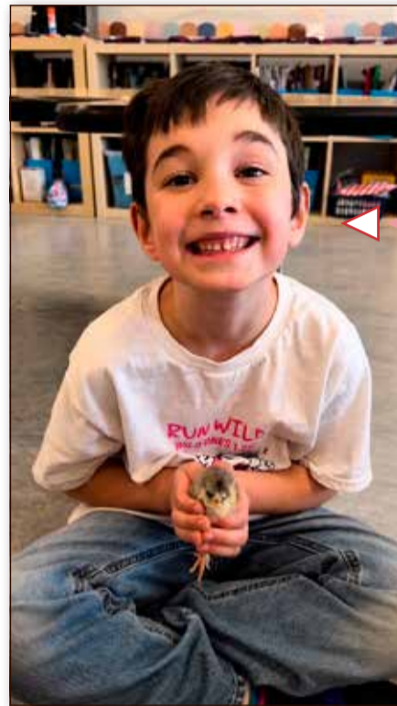
A student in Morinville Public School's Grade 2T class proudly holds one of the newly hatched chicks on May 8th during a classroom hatching project that gave students a hands-on learning experience this spring.