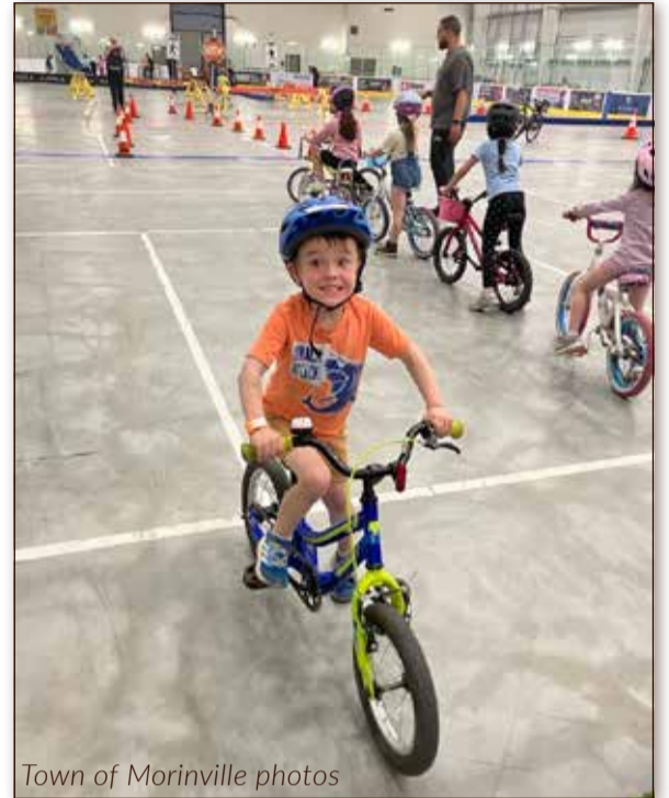
Town of Morinville photos

The Bike Rodeo was also aimed at promoting healthy outdoor activity ahead of the summer season, encouraging children and families to stay active while learning skills that can help