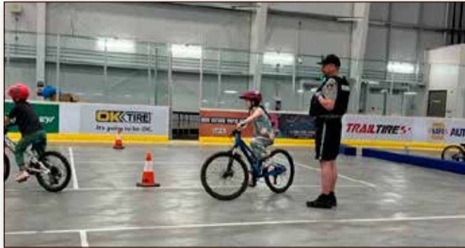
A community safety officer watches as a young cyclist navigates part of the obstacle course during the 2026 Bike Rodeo at the Morinville Leisure Centre on May 7.

encouraged to register ahead of time to take part in the event and enjoy the additional activities offered throughout the program.