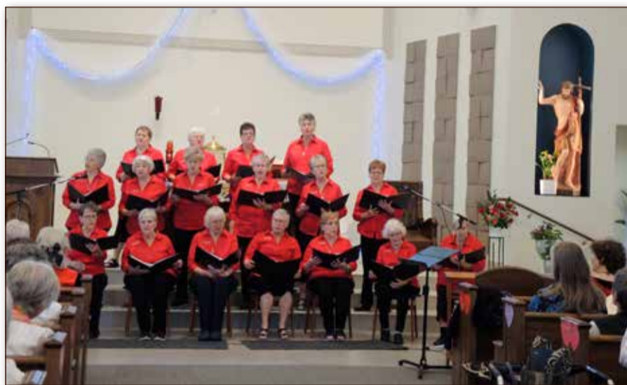
The Westlock MerryMakers

The festival will move to Bonnyville next year as part of its annual rotation among participating communities.