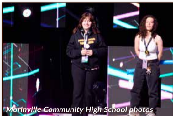
Morinville Community High School photos