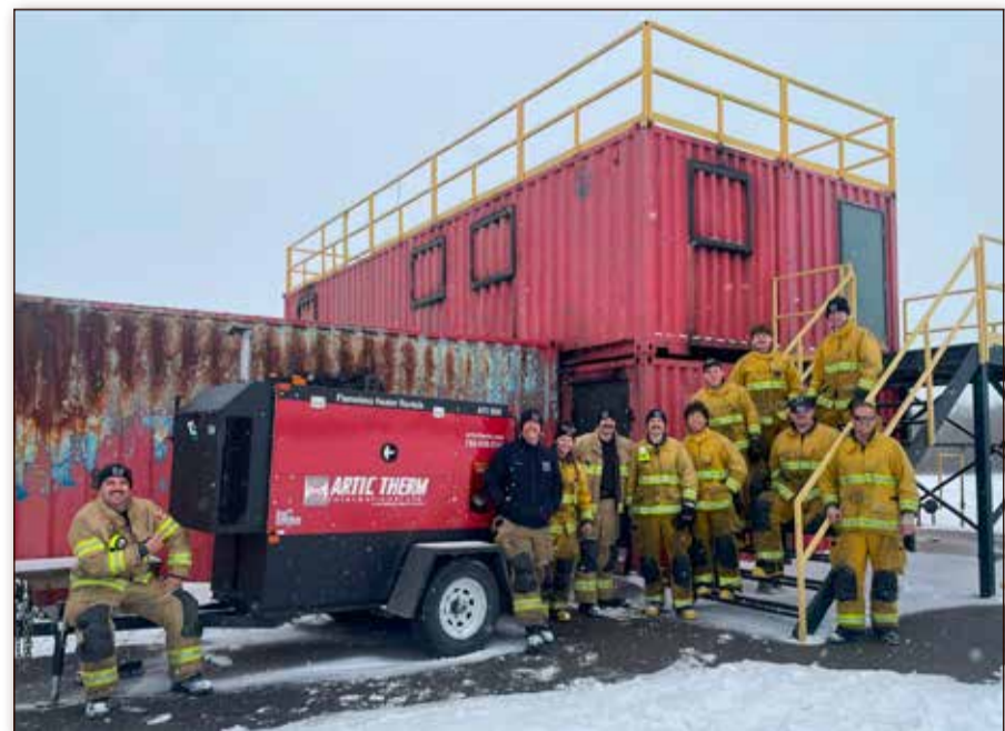
Sturgeon County Emergency Services extends sincere thanks to Artic Therm in Morinville for their outstanding support during a weekend of extreme cold. Their team ensured the training facility remained warm and operational, allowing two NFPA Level 1 Firefighting courses to proceed safely and without interruption. Their commitment to community safety and training made a meaningful difference.