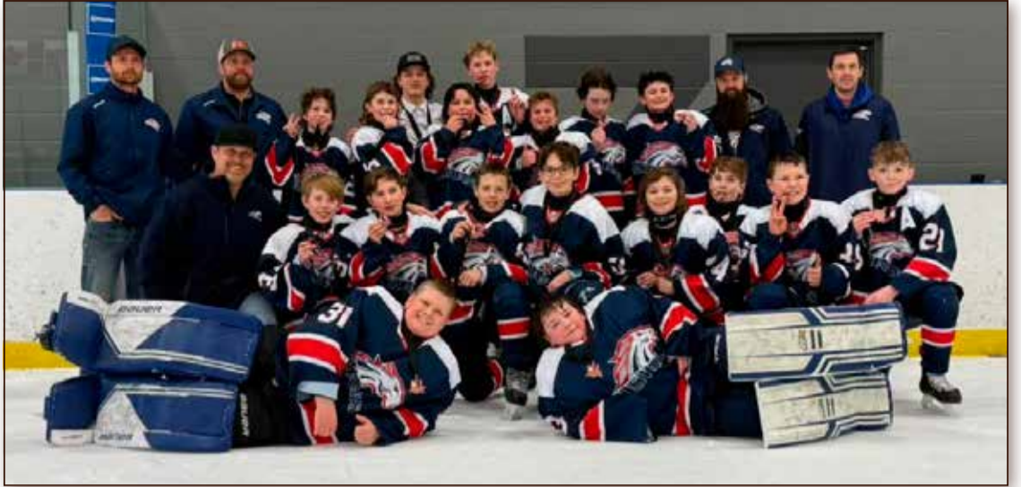
SU501 poses on the ice after winning bronze at the KC Wrap-Up Tournament in Edmonton, concluding a strong season. The team's success reflects the dedication of players, coaches, and the support of families and fans throughout the year.