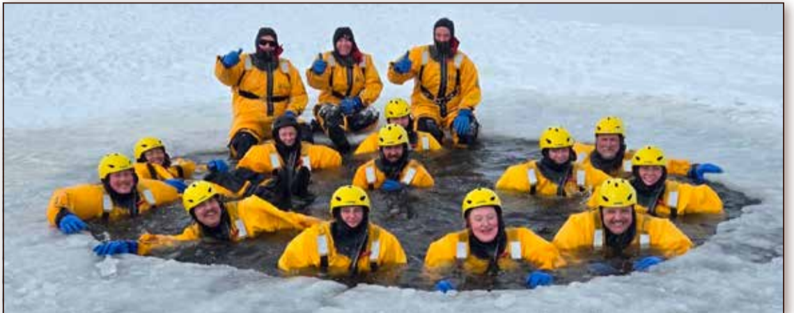
Sturgeon County firefighters completed hands-on ice rescue training on March 23, with 12 new members earning certification while others refreshed their skills. The course covered ice safety, rescue techniques, equipment use, and hypothermia response - ensuring crews are ready for emergencies on frozen water.