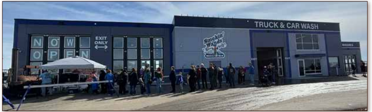
The exterior of Smokin' Wands Truck & Car Wash's new Morinville location, the second site for the locally owned family business.