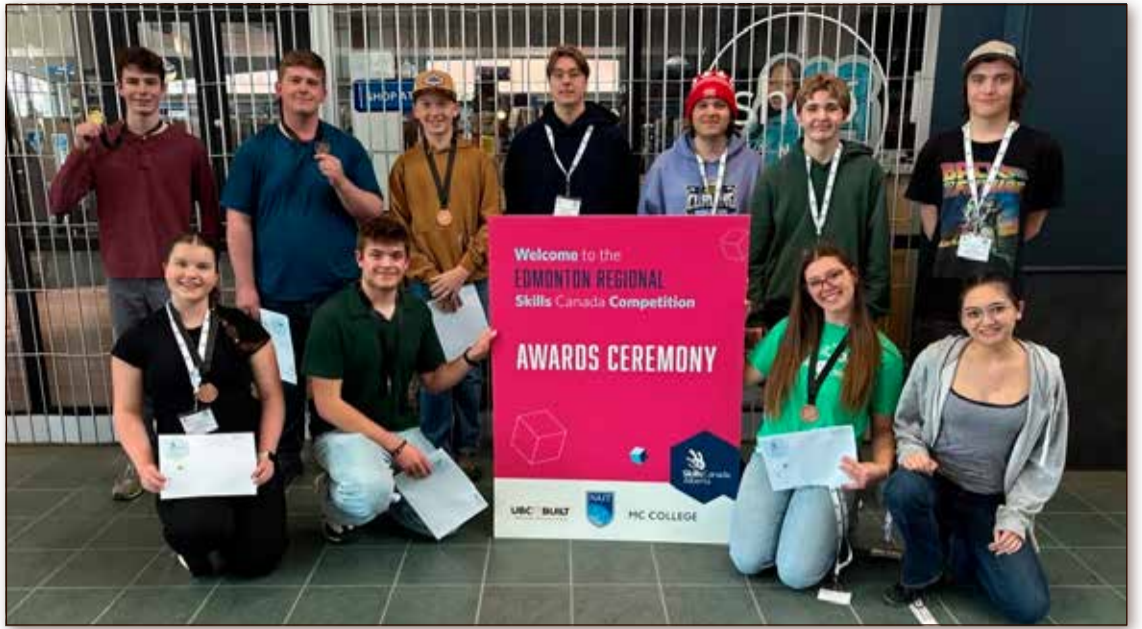
Students from Morinville Community High School are recognized following strong performances at the Skills Alberta Edmonton Regionals on April 11, where six students earned podium finishes and qualified for the provincial competition in May.

*The latest data were compiled by Ipsos on behalf of MNP LTD between March 10 and March 11, 2026. For this survey, a sample of 2,000 Canadians aged 18 years and over was interviewed.