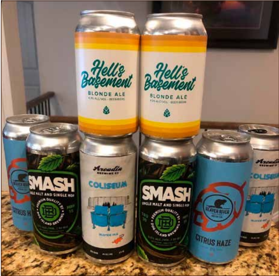
A sample of the Alberta craft beers featured in a Morinville Craft Beer Club group buy, including brews from Hell’s Basement, Arcadia Brewing, Beaver River, and Dog Island Brewing.