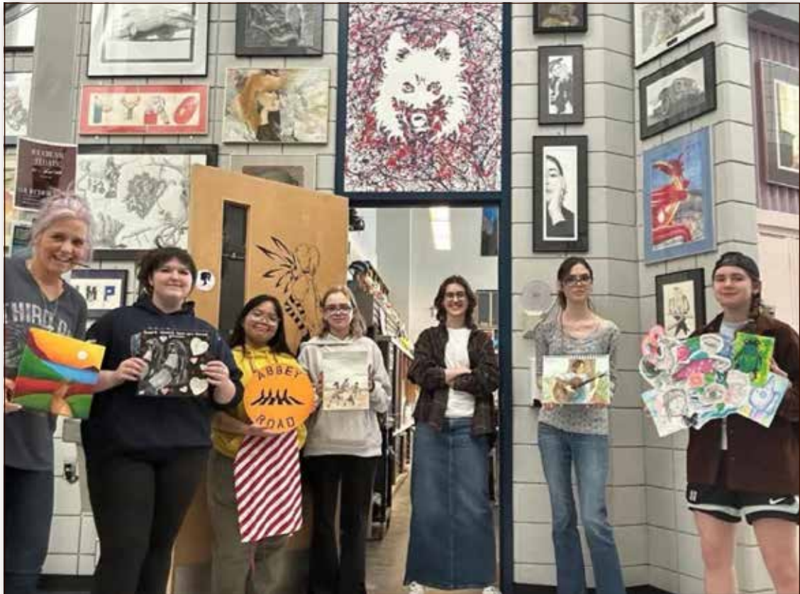
Art students at MCHS show off their creations during a workshop hosted by Mrs. Ricioppo on April 5. The artwork will be featured in the silent auction at the upcoming Coffee House 2025 event, themed "A Road Less Travelled".