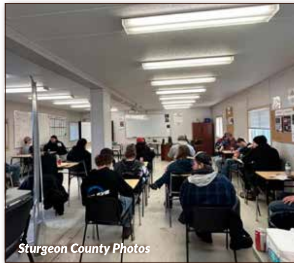
Sturgeon County Photos