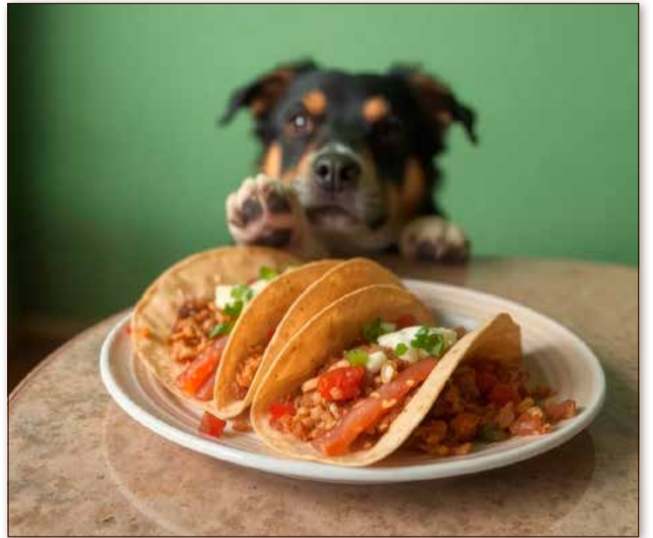
It's hard to keep your paws off of tacos, and tacos and tunes offers area residents an opportunity for an evening of great food and music in aid of our four-legged friends.

Proceeds from Tacos and Tunes will go toward SCARS' Walls for Winter Program, providing critical animal shelter during Alberta's coldest months.