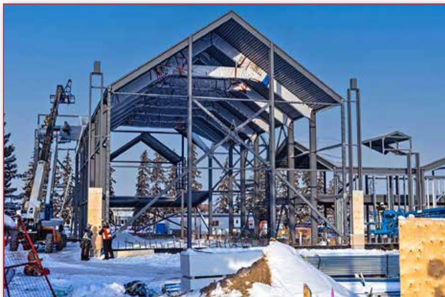
Work was progressing nicely on St. Jean Baptiste Church in Morinville in late December. The church is set to officially open for Christmas Mass in 2025.