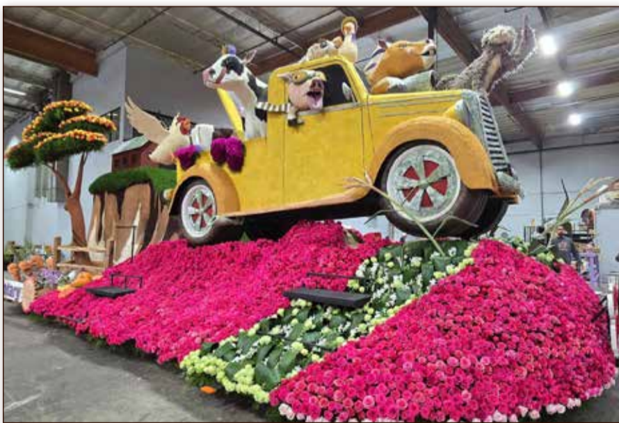
The Rotary Rose Parade Float Committee (RRPFC) float for 2025.