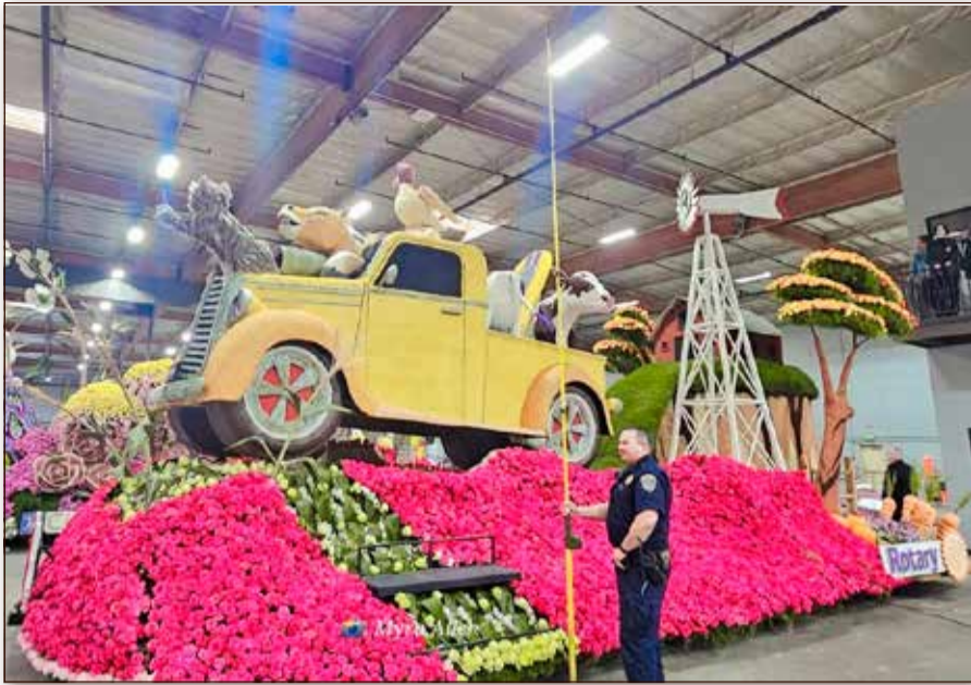
The float won the Tournament of Roses Volunteer Award for the Most Outstanding Floral Presentation for a float under 35 feet in length.