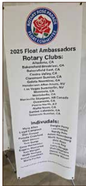
The 2025 RRPFC banner with supporting Rotary Clubs and individual ambassadors from Canada and USA.