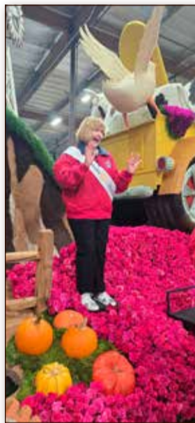
Rotary International President Stephanie Urchick on the float that was in the completion stage.