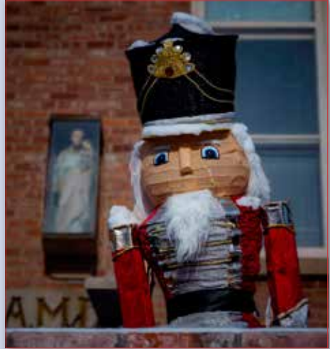
A tin soldier sits atop the outdoor area of the Notre Dame Apartments in Morinville, creating a festive visual in St. Jean Baptiste Park.

Pisces, if you feel your emotions are running high this week, try to channel your feelings into a creative project that will use them in a smart way. A friend may call asking for advice.