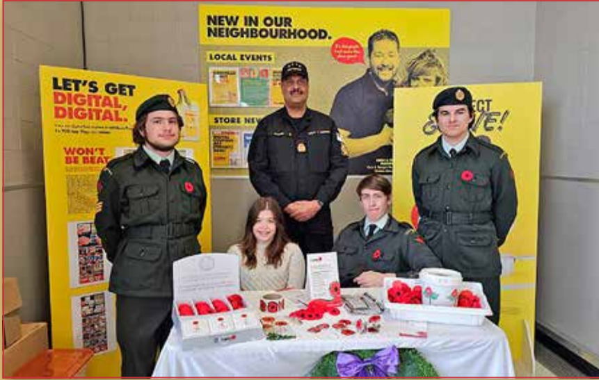
Members of the 3061 1 Combat Engineer Regiment (1CER) Royal Canadian Army Cadet Corps (RCACC) gather for a photo on Saturday, October 26. The group were on hand at No Frills in Morinville selling poppies.