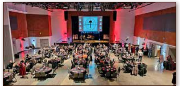
Morinville & District Chamber of Commerce's annual Business Awards Gala.