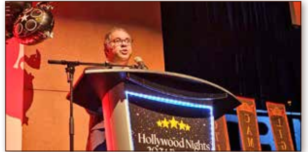
NDP Leader Naheed Nenshi speaks to local business owners at the Morinville & District Chamber of Commerce Business Awards on Saturday, October 26.