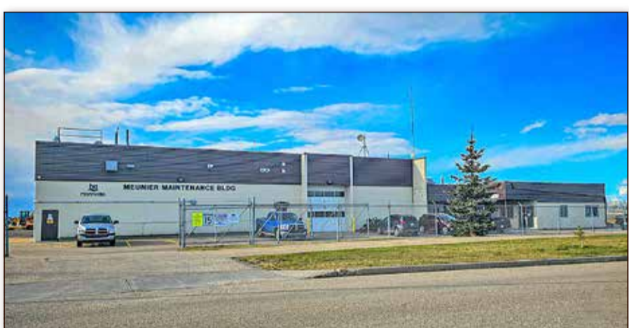
Replacement of the Town of Morinville's Meunier Maintenance Building or Infrastructure Services Building has been deferred for two years after a 4-3 vote of Council