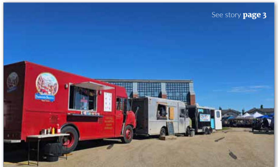
A group of food trucks were part of the recent Morinville Festival Days, one of the permitted instances under the new Mobile Vendor Bylaw, passed by Council on June 25. - File photo

Brighten your Summer with a Radiant Smile