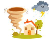
SEVERE STORMS & TORNADOS