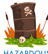
HAZARDOUS MATERIAL RELEASE