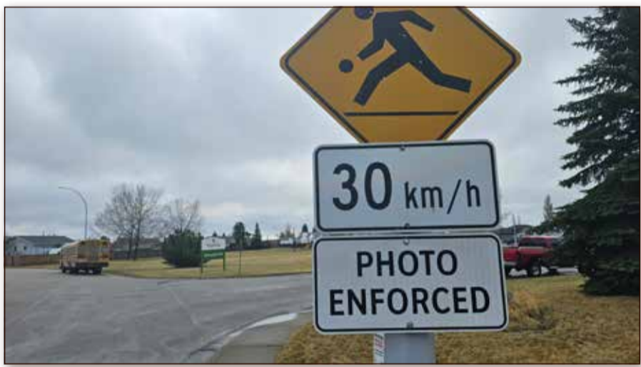
Morinville's residential speed limit will drop 10 km/hr to 40 km/hr in early June, part of the ongoing implementation of safety measures Council approved last August.