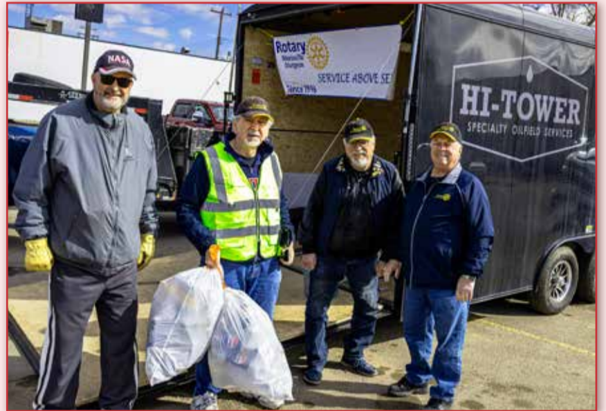
Rotary Club of Morinville Sturgeon members gathered on Saturday, April 13 in the Sobeys Morinville parking lot for a bottle drive. The Rotary has collected bottles for the past few years, using funds raised for several community initiatives.