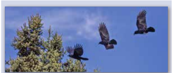
A crow's flight path to an evergreen perch is seen in this composite photo.

Funding is also made available through Community Grants, which can be up to $2,500.