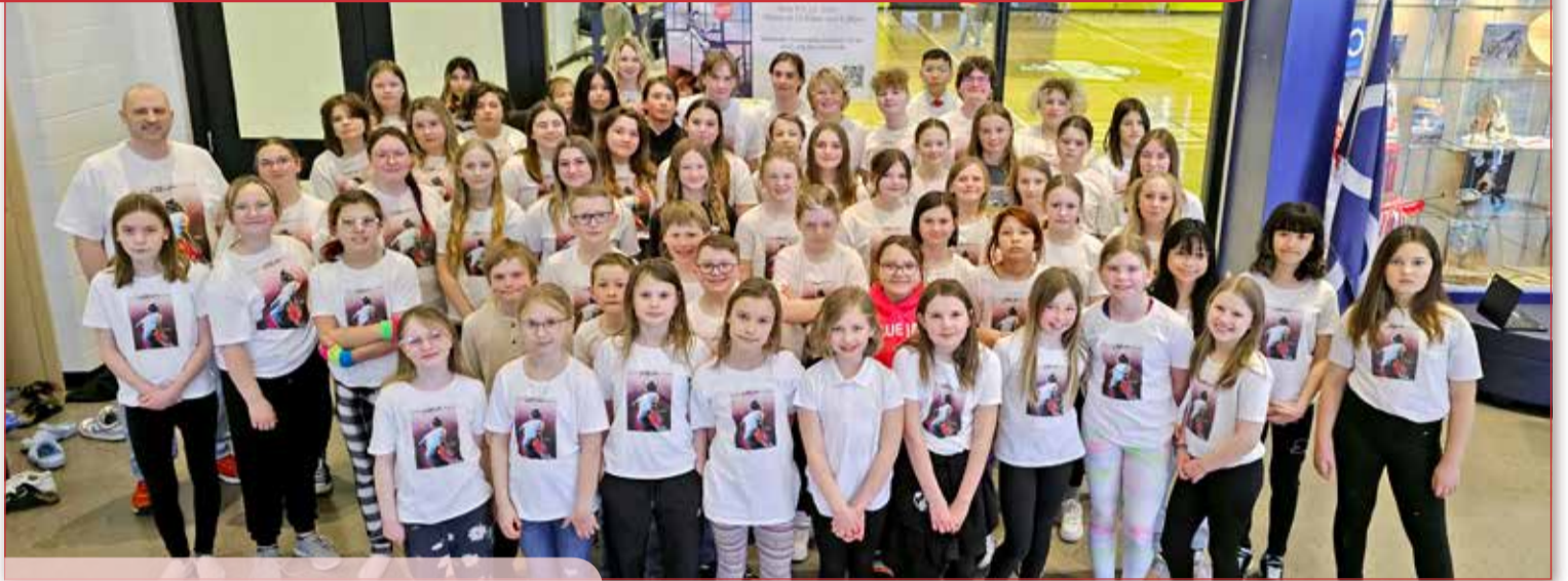
The majority of the 80-member cast for Camilla's production of Footloose pose at the school on Wednesday, Apr. 10. The show will run for four performances on May 9 and 10.

assembled two casts for the four shows, again comprising 80 students from across a broad spectrum of ages and interests.