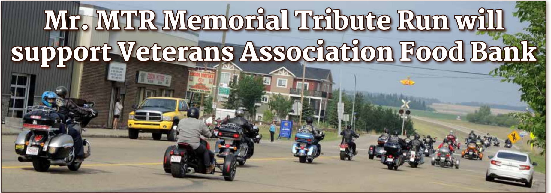
Riders depart from the Gibbons Legion in this file photo of the 2023 Mr. MTR Memorial Tribute Run.