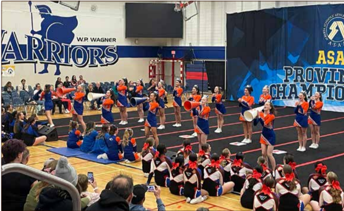
Morinville Community High School's Cheer team took part in provincials at W.P. Wagner High School over the April 5 weekend. The Girls returned to Morinville with gold on game day for their division and silver for the Advanced All-Girl Division. MCHS was also awarded a sportsmanship award.

Effective April 11, a fire advisory has been issued for the Town of Morinville due to dry conditions. Please use caution while using recreational backyard fire pits (permit required), charcoal and wood fuel barbeques. The fire advisory will remain in effect until conditions improve. For updates, please visit: https://www.albertafirebans.ca/