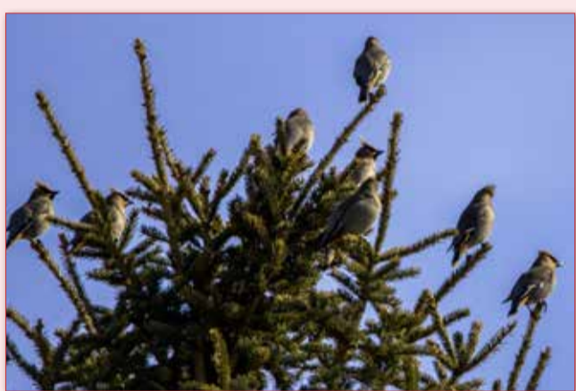
A group of waxwings sit atop an evergreen tree, a sure sign that spring has returned.