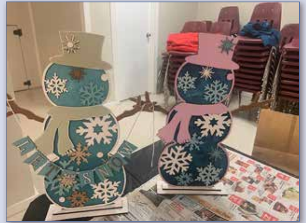
In December 13, nineteen women attended Bon Accord's final Art Night Out for 2023. Several beautiful pieces were crafted while attendees savoured hot chocolate and cookies and listened to Christmas songs. The Town of Bon Accord organized a range of craft nights, field trips, and community activities throughout the year. For future events in 2024, please visit BonAccord.ca .

"We couldn't do this without the generous donations from residents. We want to continue to make a difference in the local community."