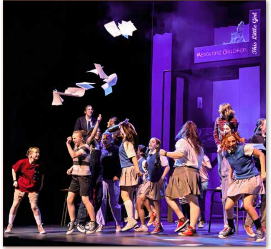
Matilda is born to less-than-happy parents in the opening scene of Morinville Community High School's production of Roald Dahl's Matilda.