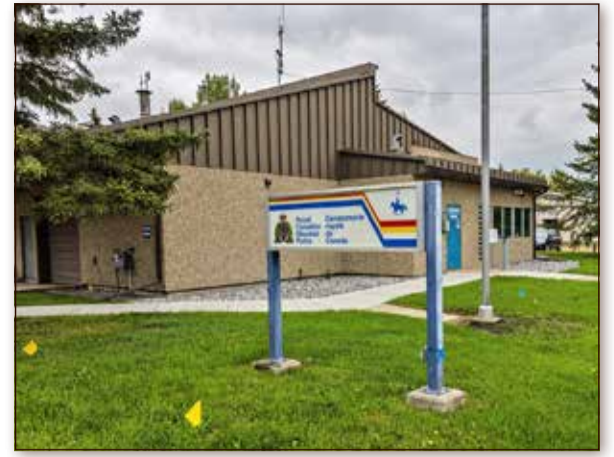
Council is looking to create more engagement opportunities between residents and the Morinville RCMP.