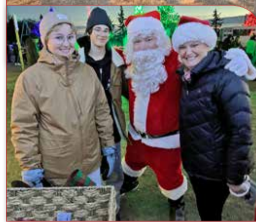
The annual Christmas festival in the town of Legal unfolded with great success over the past weekend on Saturday, December 2nd, at Legal's Centennial RV Park. The event witnessed a remarkable turnout, drawing in a vibrant and enthusiastic crowd eager to partake in the festive celebrations.