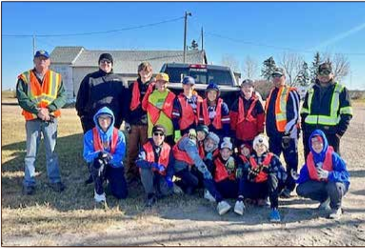
SU501 Hockey Team, parents and Legal Lions Club members pose for a photo prior to cleanup along highway.

Some of the players were amazed at the type of garbage that ends up on the side of the road. Great day had by all.