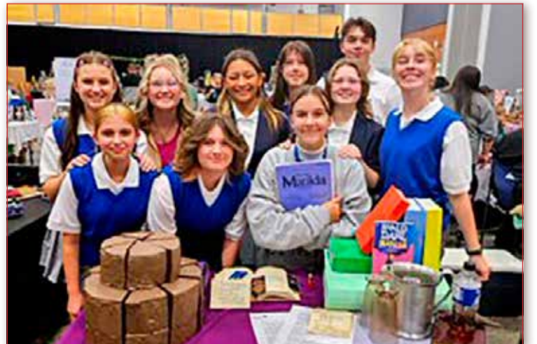
Morinville Community High School (MCHS) is bringing Roald Dahl's Matilda to the Morinville Community Cultural Centre for three nights on December 6 to 8. Some of the production's cast were at the Morinville Farmer's Market Christmas Market and Craft Sale on Sunday, November 19, talking about the show and selling tickets. There are two markets left on December 3 and 10 from 10 a.m. until 4 p.m. at the Morinville Community Cultural Centre.