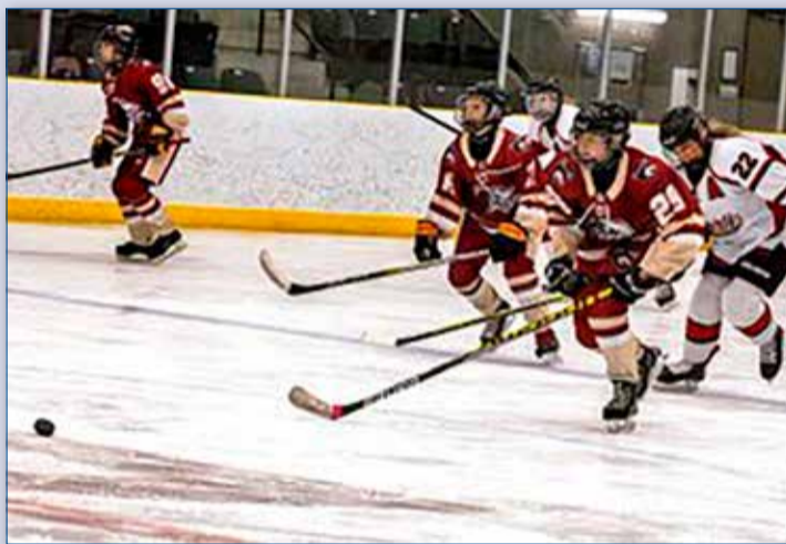
The Sturgeon Fillies hosted their first tournament from November 17 to 19 in Morinville and Legal. The opening game on Friday, November 17 was between the U18 Fillies and the Fort Saskatchewan Fury. On Sunday, November 19, the U18 Lakeland Jaguars took gold in that Division, with the U18 Olds Grizzlyls taking Silver and the Fort Fury taking Bronze. In the U15 Division, the U15 West Central Wildcats took Gold, the U15 Sturgeon Fillies Silver, and Bronze went to the U15 Fort Saskatchewan Fury. Showcases were also held over the weekend for the U11 and U13 Divisions.