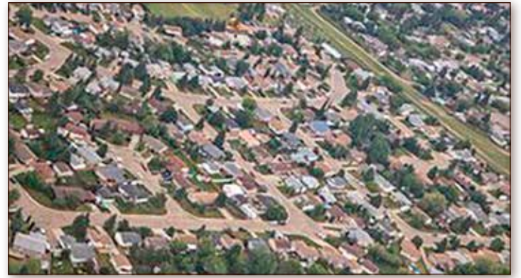
The Morinville 2024 Budget, as proposed, would lead to a tax increase of 7.3%, with the cost for an average home valued at $350,000 rising by $213.08 next year, or $17.76 per month.

The council vote seeking information about the budgetary implications of staff cost reductions reflects an ongoing aspiration on the