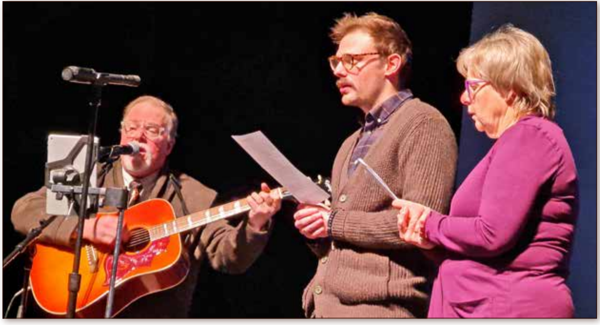
The Bulger family sings Let It Be Christmas at the 2023 edition of the Community Christmas Celebration.