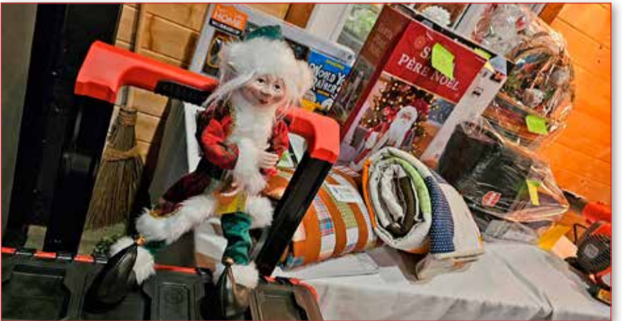
The Midstream Support Society held its annual Santa Store Auction at the Free Spirit Ranch on Saturday, November 17. This year's event included a buffet dinner with the auction, raffle and 50/50 draw. The dinner and auction raised $20,561 to support local families this Christmas season. Combined with $5780 in additional donations, a grand total of $26,341 was raised.