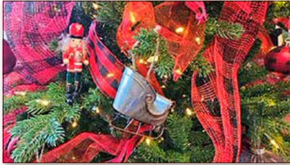
The 24 Days to Christmas program will launch soon, offering crafts, recipes and stories over the Christmas season.

"It starts on Dec. 1. The first day is a craft. The second day is a recipe, and the third day is going to