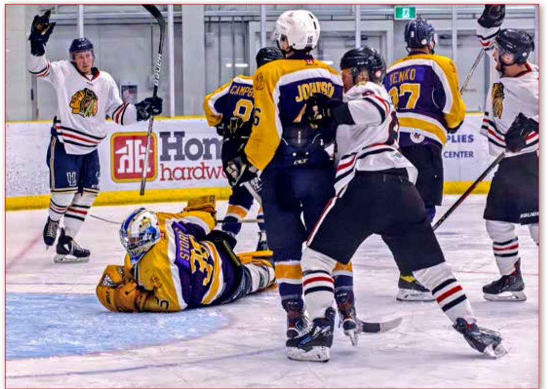
The Westlock Warriors celebrate a goal early in the first period of the Morinville Senior AA Kings home-opener at the Morinville Leisure Centre on Sunday, October 1. See article on page 4