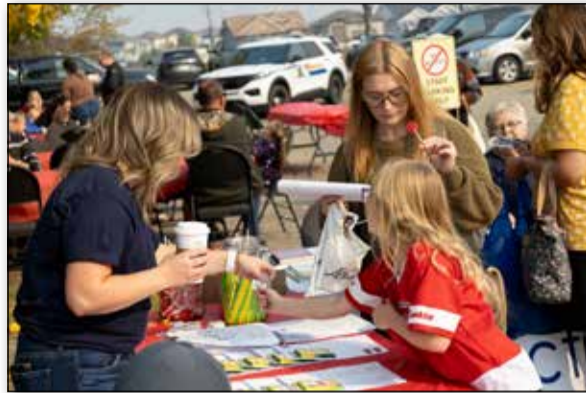
Morinville Enforcement Services had an information booth with some swag for visitors to take.

The Royal Canadian Mounted Police (RCMP) celebrates its 150th anniversary in 2023, marking a century and a half of dedicated service to Canada. Established on May 23, 1873, the RCMP has played a pivotal role in maintaining law and order,