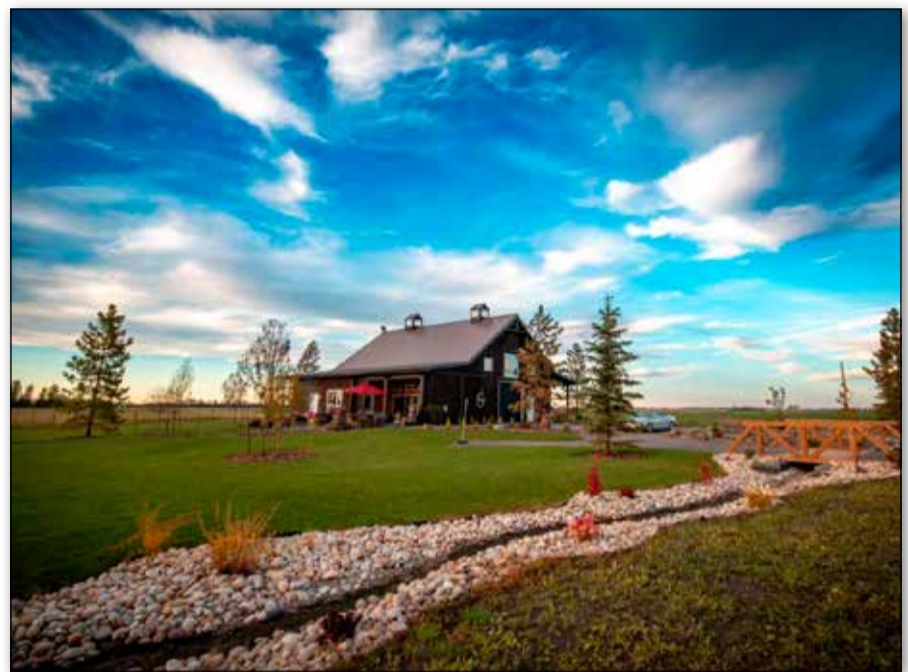
Free Spirit Ranch, located just outside of Morinville on Range Road 253, will be the venue for this year's Santa Auction in support of the Midstream Support Society's Christmas initiatives.

The Annual Santa Store Auction supporting the Midstream Support Society takes place on Saturday, Nov. 18, and organizers are looking for auction items for the fundraising event. The annual auction has been a popular Morinville event for more than a quarter century. It is the charity's largest revenue source to help families in need provide a Christmas experience for their children.