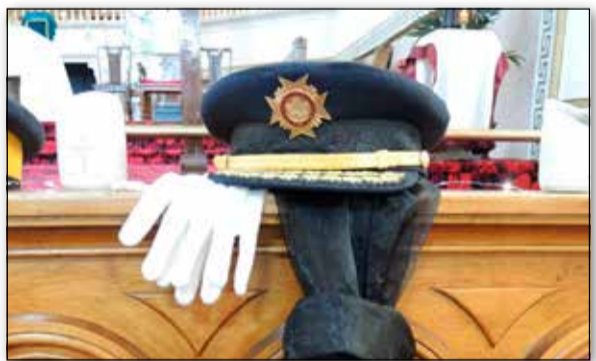
A firefighter hat and gloves lay on the altar during the 2022 Blue Mass. This year's service will be held on Sunday, Sept. 24 at 10 a.m. at École Notre Dame Elementary School.