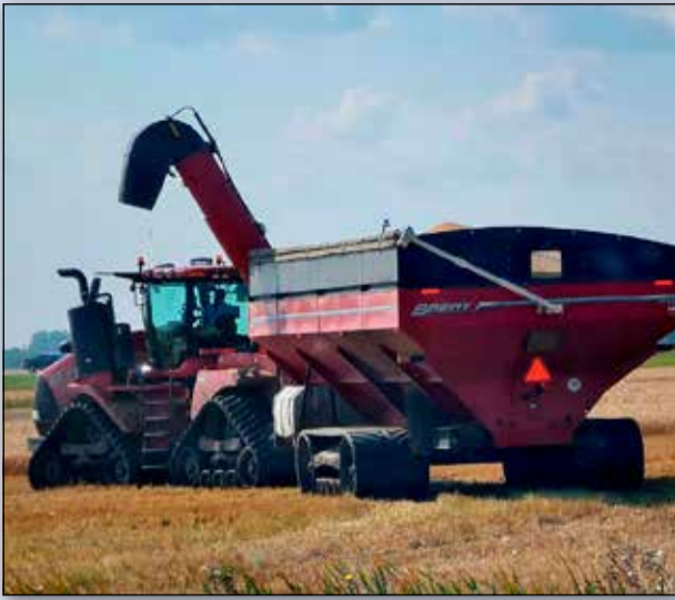
Work was underway in the fields just outside of Morinville on Thursday, Sept. 7.