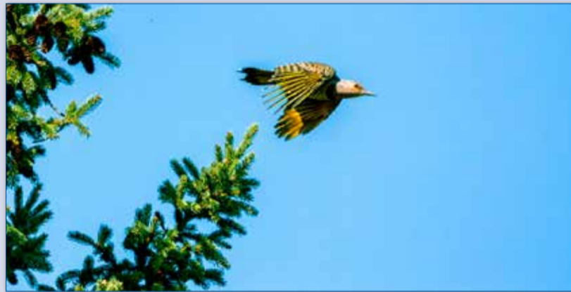
A male yellow-shafted northern flicker takes flight from an evergreen tree. The northern flicker is a larger brownish coloured woodpecker.

Household Hazardous Waste Roundup Saturday October 7 from 10 a.m. to 2 p.m. Gibbons Cultural Center