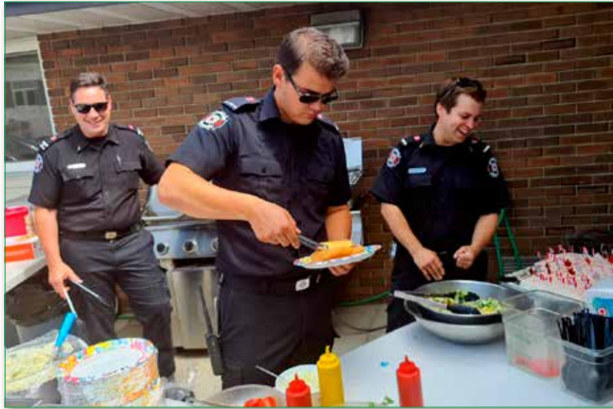
Morinville Fire Department members served up a barbecue lunch for seniors and their families, during Heritage Lodge's Canada Day celebrations.