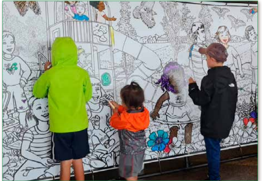
Children colour on the giant colouring wall at Morinville's indoor Canada Day celebration, held at the Morinville Community Cultural Centre on July 1.