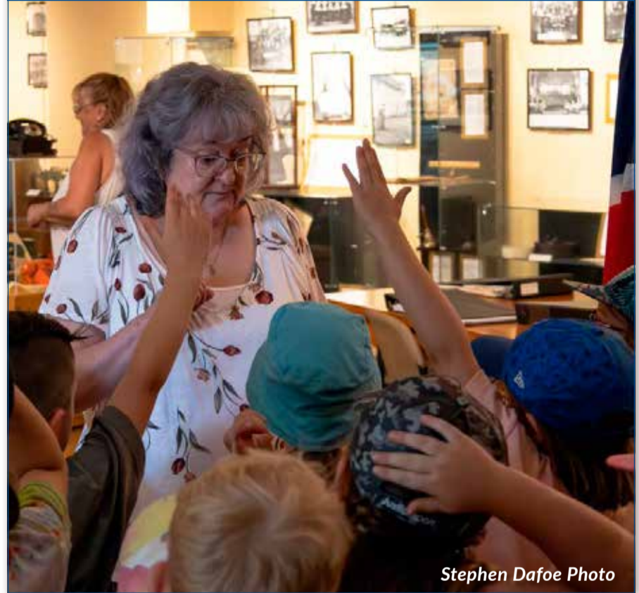
Stephen Dafoe Photo