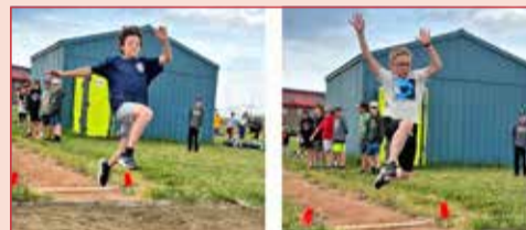
The Morinville Community High School track meet was filled with exhilarating moments of long jump fun. The Huskies, with their outstanding performance, left a lasting impression.