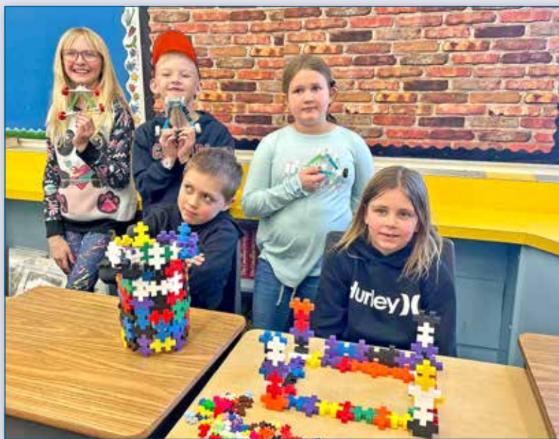
At Legal Catholic School, science students had the opportunity to engage in practical learning experiences. For example, fourth-grade students were able to create their own mobile devices and vehicles, while third-grade students worked with diverse materials to construct various objects.