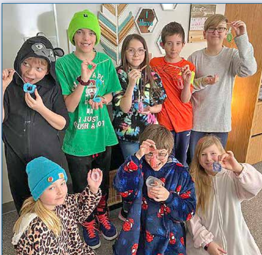
Grade 5 science students at a Catholic school conducted an experiment in which they grew their own crystals using super-saturated solutions.