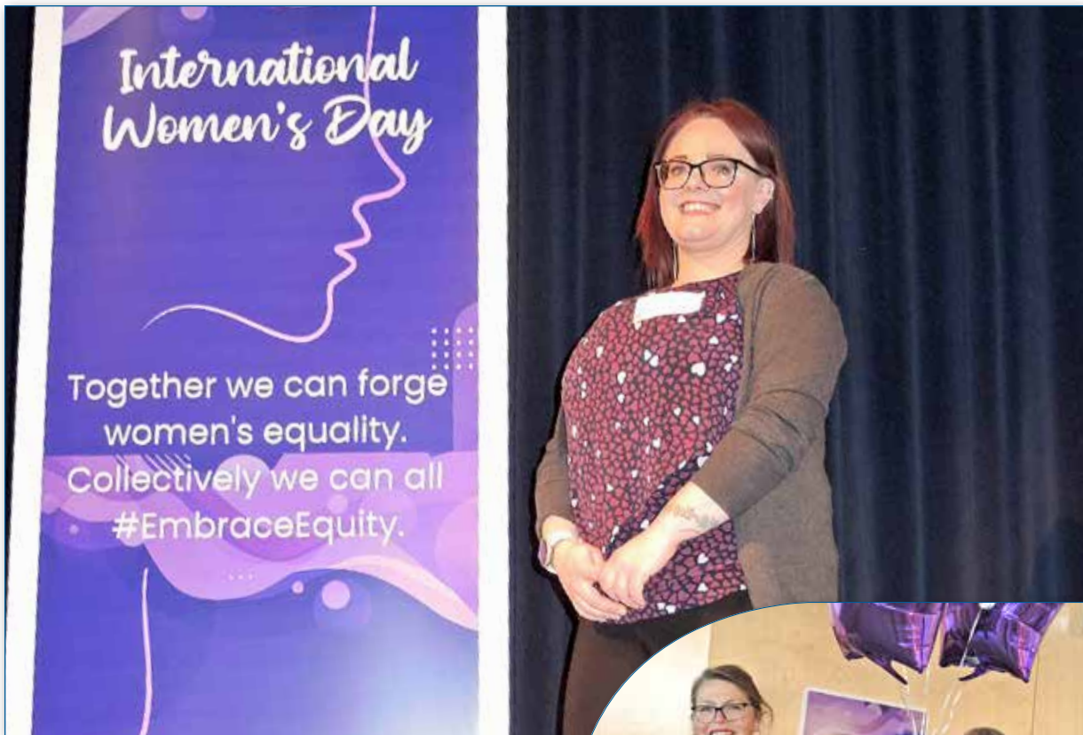
The Morinville & District Chamber of Commerce hosted an International Women's Day Celebration at the Morinville Community Cultural Centre on Thursday, March 9. The evening began with a Sip and Shop with wine, charcuterie boards and an opportunity to shop with seven Morinville and Sturgeon County women's businesses. The formal program included a guest speaker who will talk about the importance of setting boundaries, an interactive segment called What Colour is Your Personality, and a panel of women entrepreneurs.