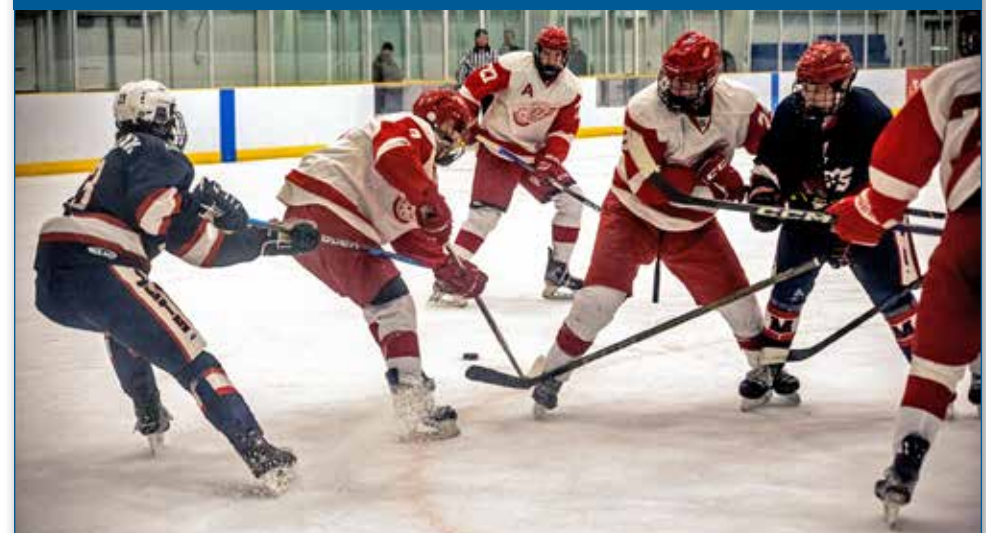
The Morinville Jets playoff series came to an end on Tuesday, February 28, after losing three straight in a best-of-five second round to the North Edmonton Red Wings. See article on page 8