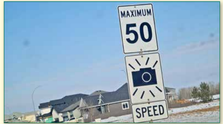
Morinville’s current 50km/h speed limit could drop to 40km/h in residential areas if the Town’s new Traffic Safety bylaw passes the second and third reading. - File Photo

The bylaw is scheduled to be brought back before council for a second reading in April, although that might be delayed