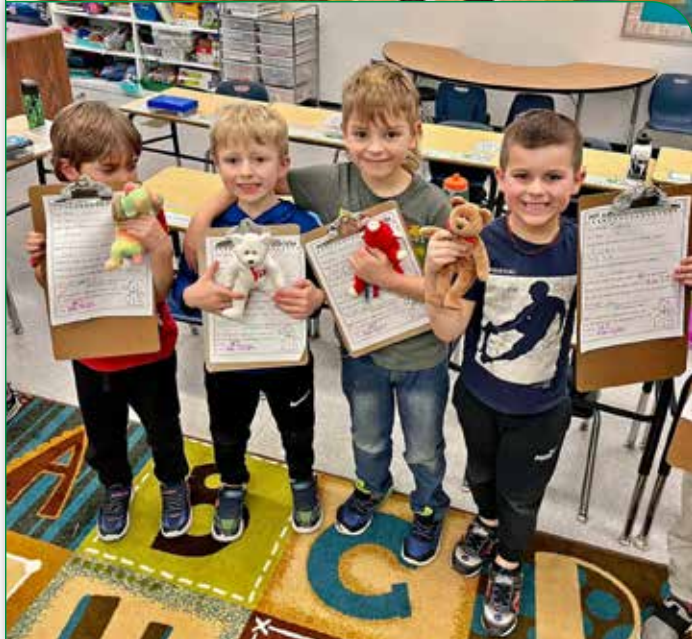
The Grade 1 Classroom at Legal Catholic School recently celebrated Adoption Day as part of their home reading program. The students had the opportunity to apply for the adoption of a unique pet that requires no food or water. Instead, these special pets thrive on cuddles and reading! It's a heartwarming way to encourage a love for reading while also teaching children about the responsibility of caring for pets.