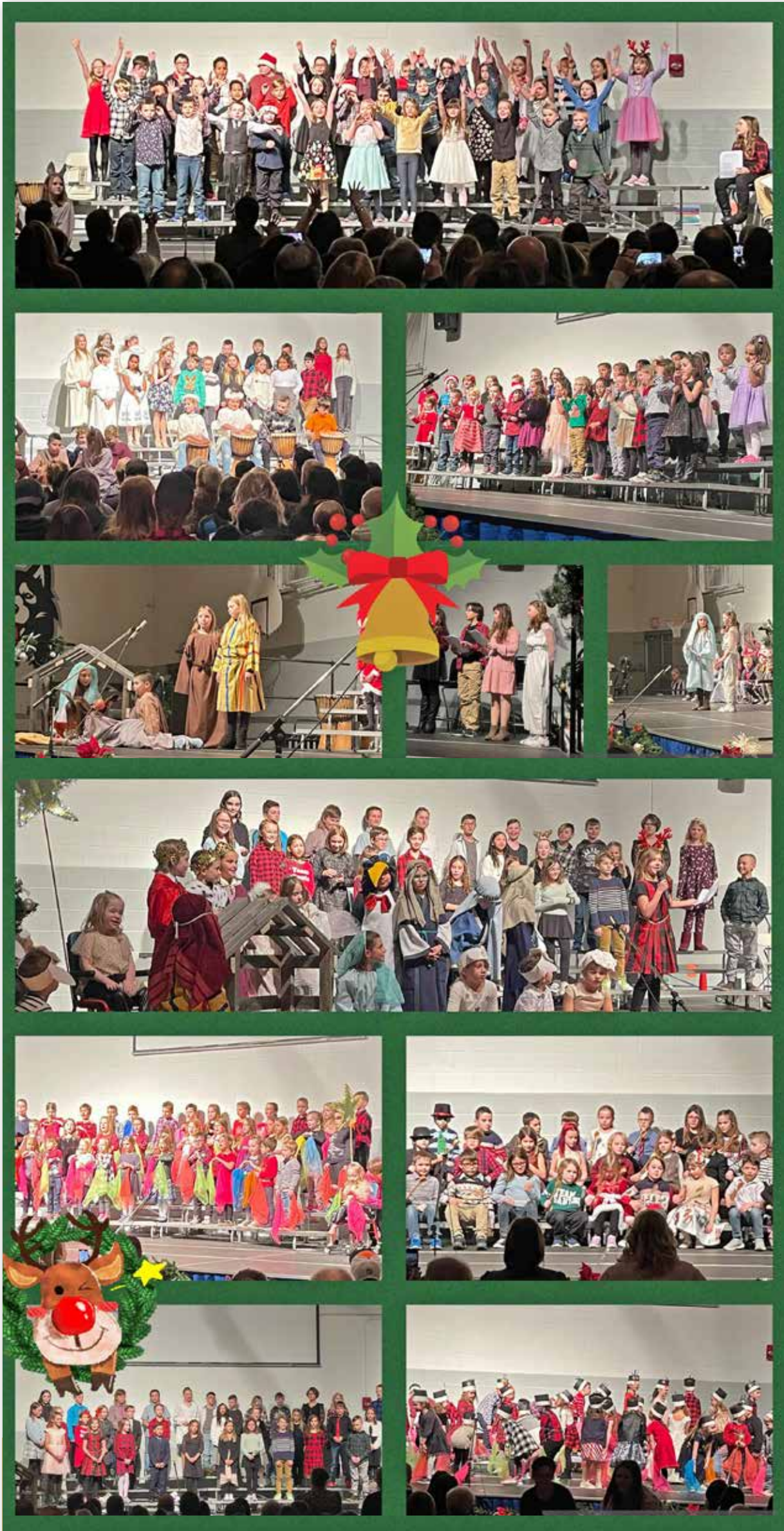
A wonderful two nights were filled with the magic of the Christmas season at École Notre Dame School in Morinville. The concerts were put on by staff and students and the community and were enjoyed immensely.

For a full review of Sturgeon County’s 2023 Operating and Capital Budget and to watch a recording of the budget deliberations, visit SturgeonCounty.ca/Budget .