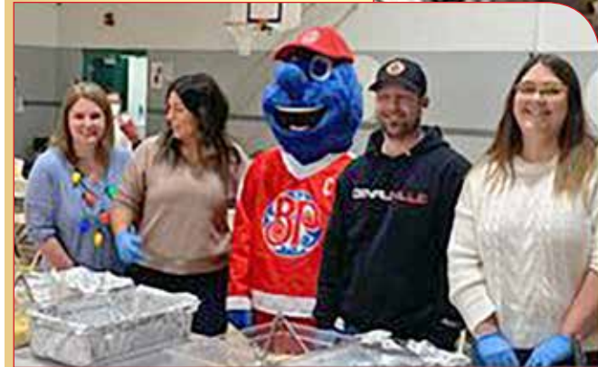
Morinville Boston Pizza was kind enough to make a delicious pasta lunch at École Notre Dame School just before the holidays! - Submitted Photos