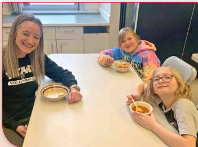
Just before Christmas, the Legal Catholic School made group soup in dynamic options. It was very yummy on a very cold day. - Submitted photos