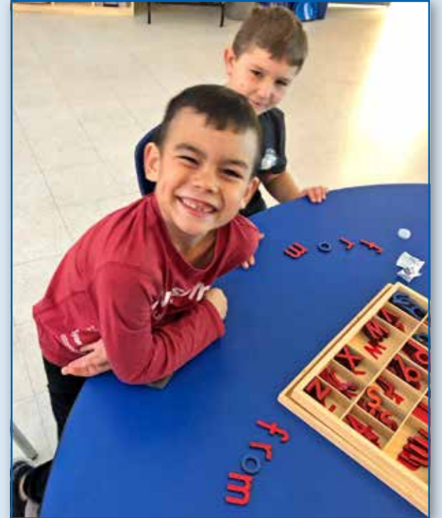
The new alphabet boxes are just what is needed for the literacy work from Pre-K to Grade 4 at Legal Public School.