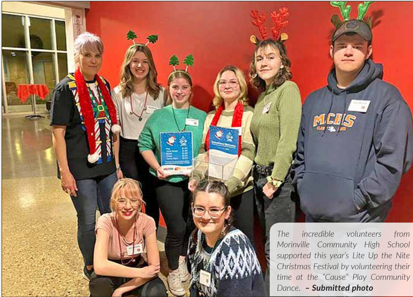
The incredible volunteers from Morinville Community High School supported this year's Lite Up the Nite Christmas Festival by volunteering their time at the "Cause" Play Community Dance.