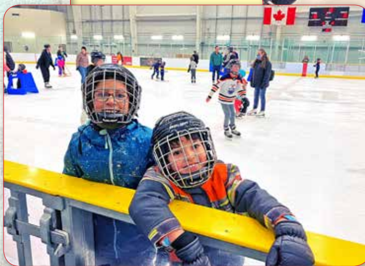
TChampion Pet Foods sponsored the "Family Holiday Skate" as part of the 2022 Lite Up the Nite Christmas Festival. Over 170 people came to the Morinville Leisure Centre to enjoy a free skate with great giveaways and activities. Plunge Mechanical donated a great door prize, and ACFA Centralta, delicious maple candy and the 1st Morinville Guides offered their help.