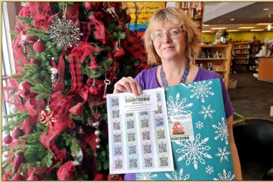
The Morinville Community Library has been mixing crafts, recipes and Christmas stories for the second year as a lead-up to Christmas. The 24 Days to Christmas Countdown, sponsored by the Rotary Club of Morinville-Sturgeon, started on December 1 and runs until Christmas Eve on December 24. Each day, the library's website features a story video, craft instructions, or a recipe prepared for patrons and their families to enjoy. You can find details on each day's activity at https://www.morinvillelibrary.ca/programs/24days or you can visit the Library for a sheet of QR codes to access the program.

Beltone™ Helping the world hear better Serving Alberta since 1964