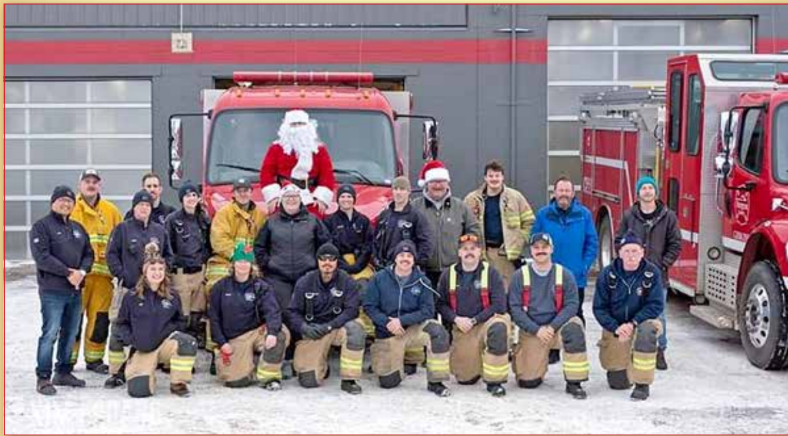
On Sunday, December 4, the Gibbons Fire Department went throughout Gibbons picking up for the Food Bank, leaving bags of candy as a thank you for donations. This year, the community raised $1,035 and 7464.31 lbs of items for the Food Bank.