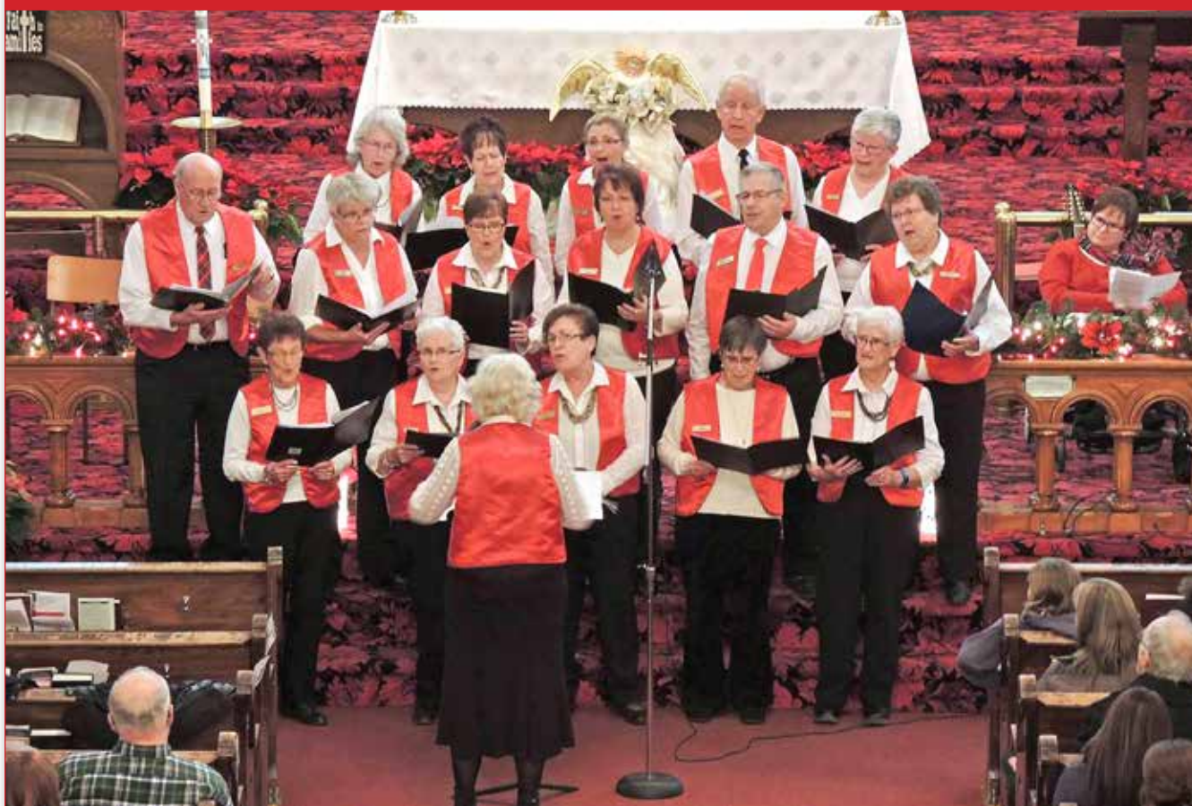
The Morinville minstrels perform in this file photo. The Minstrels are once again organizing the annual Community Christmas Celebration, an event that started 44 years ago and was halted the past two years.