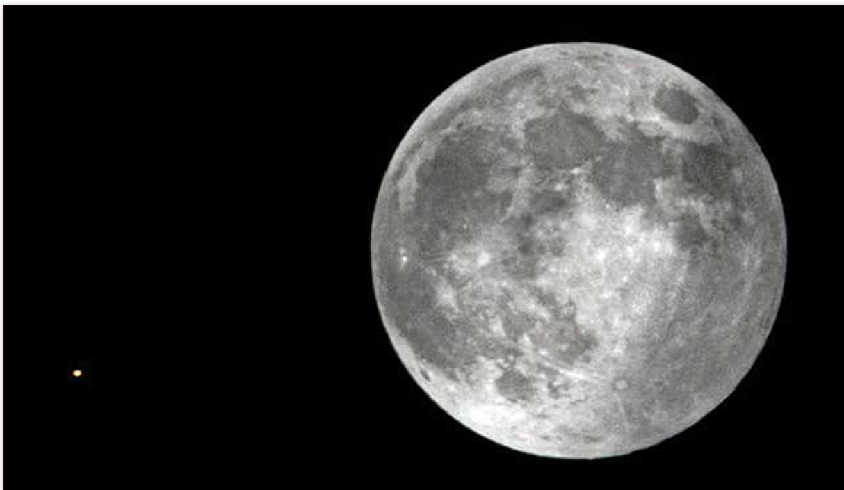
Those looking up got a rare view Wednesday night. Mars, close to the full moon on one side, vanished and then reappeared on the other side over the next three hours. This is called an occultation, and the next time it will occur is in January 2025. The first photo was taken at 7:30 p.m., the second at 10:30 p.m.