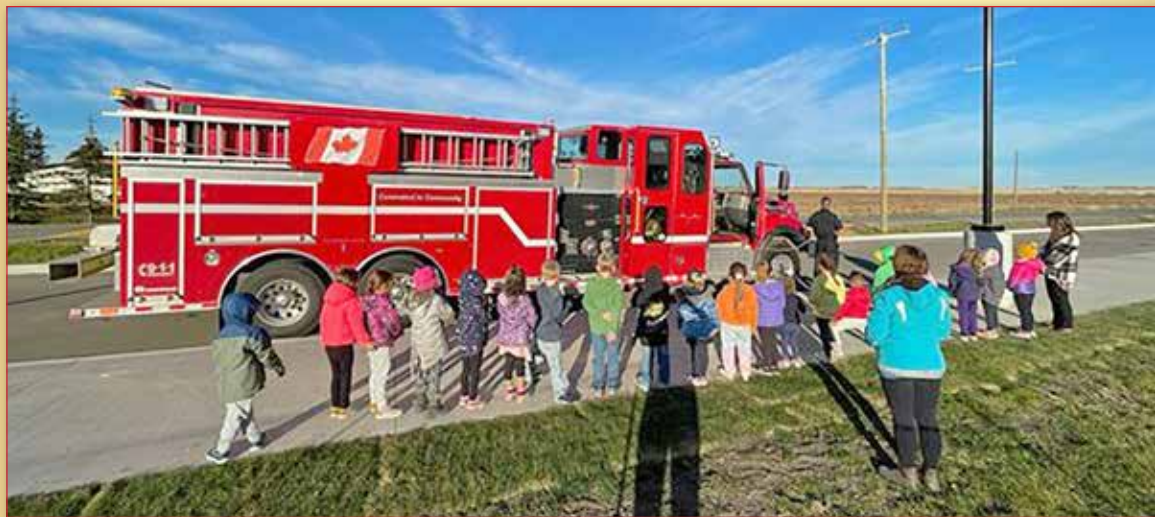
As part of #FirePreventionWeek2022, Sturgeon County firefighters were invited to area schools to talk fire safety. The firefighters presented to more than 850 elementary students from Pre-K to Grade 4 at Sturgeon Public Schools.