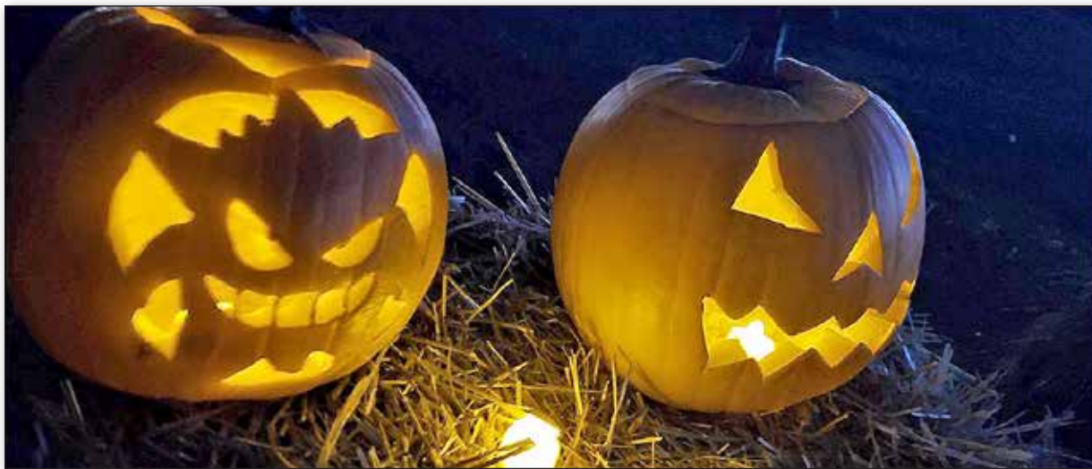
Halloween pumpkin carving talent will be on display after Halloween for all to see at the Skyline Diamonds on November 2 from 6 p.m. to 8 p.m.