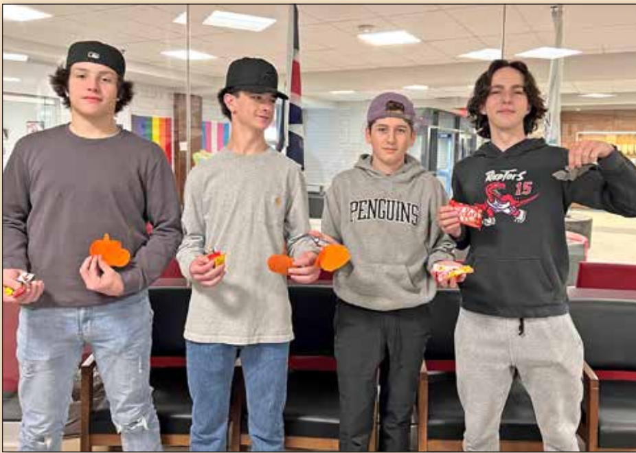
Last week's Scavenger Hunt at Sturgeon Composite High School in Morinville was all about facing your fears! There was a variety of fun and spooky challenges to be completed.