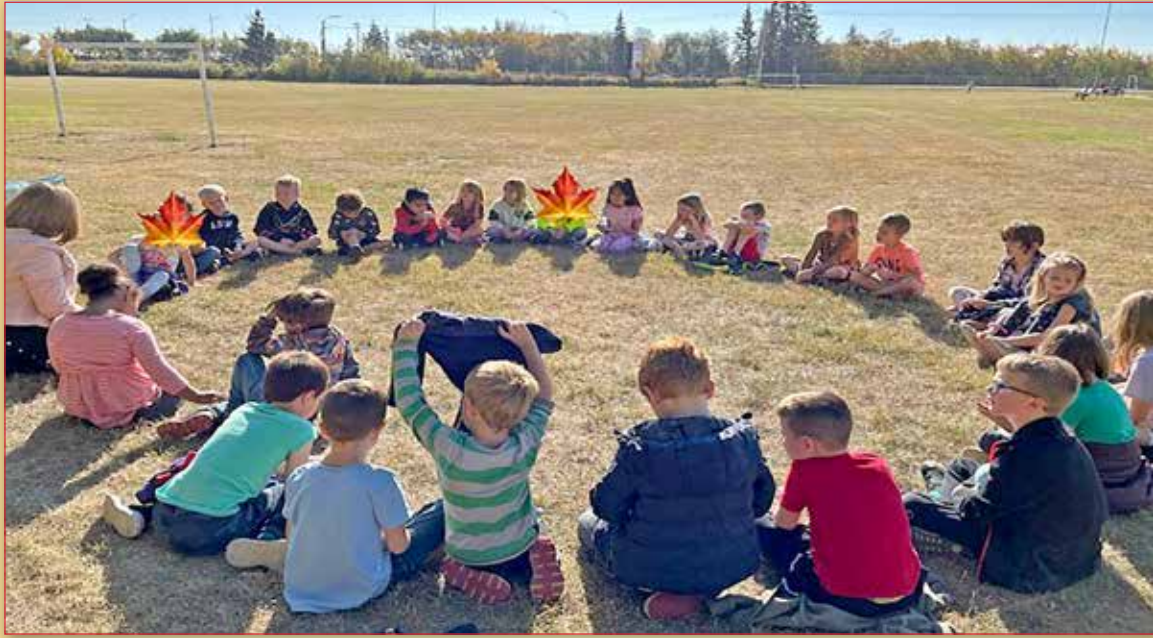
1Mc and 1R class from Bon Accord Community School, spent some time outside in our sharing circle talking about how they feel when they are outside in the air. We feel the grass, the cool breeze and the warm sun. We see the trees and the changing leaves. We are thankful to be included all together as one big group enjoying this fall day. In a circle, we all feel included and accepted, a place where everyone matters.