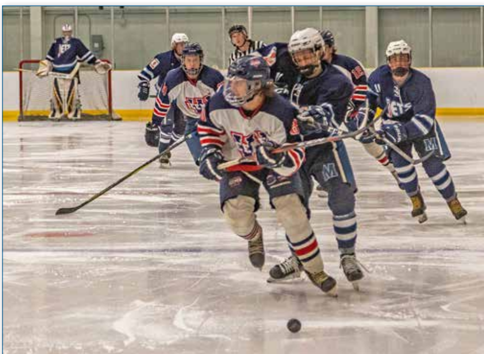
The Morinville Jets won their home opener against the Wetaskiwin Icemen handily on Sunday, September 25. The 7-1 win over the Icemen was their second win of the Capital Junior Hockey League's opening weekend. The Jets defeated the Fort Saskatchewan Hawks 5-4 in overtime on Friday, September 23.