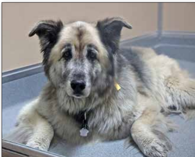
A lost dog awaits being reunited with its owner at the SCARS facility in Morinville

The event has sold out in past years, so people are encouraged to get tickets soon. SCARS is