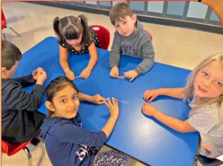
Bon Accord Community School Kindergarten class made beaded reminders of their commitment to reconciliation last Thursday.