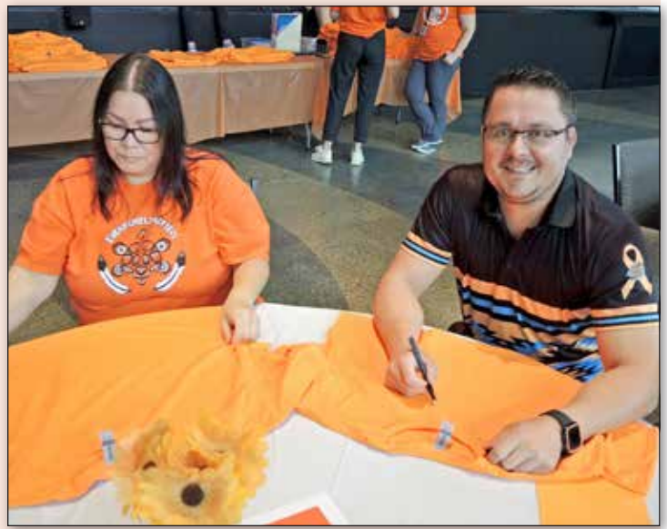
Thank you to everyone who attended our Truth & Reconciliation Event last week in Morinville.