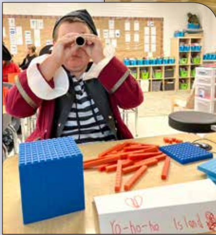
The first month of school has already come to an end! September saw the Dragons learning through Dot Day in Grade 1, gaining pirate skills in Grade 3, enjoying time outside and gym time in Grade 4 and representing our school so well at the Cross Country event!