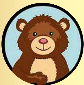
Bon Accord Community School