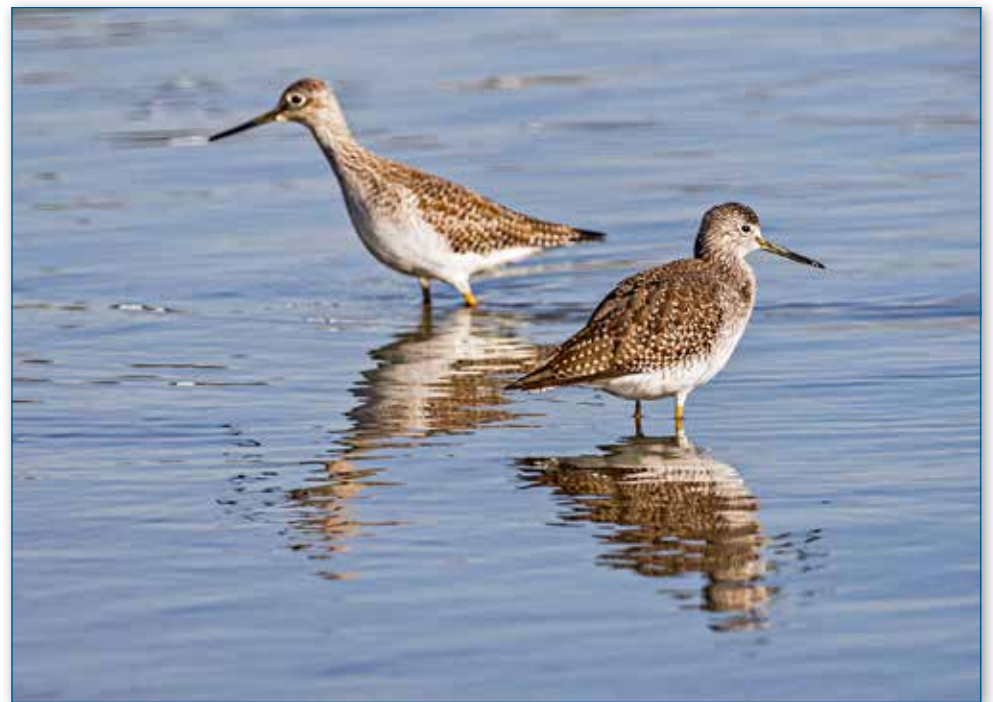
A pair of greater yellowlegs wade along the shore of Heritage Lake just outside Morinville.

Copyright: No material - news, graphics or advertising may be reproduced without the written permission of the publisher. Failure to obtain consent may result in legal action. Advertising is accepted on the condition that, in the event of a typographical error, that portion of the advertisement occupied by the erroneous item will not be charged for, but the balance of the advertisement will be paid for at the applicable rate. The publisher reserves the right to accept or refuse any or all material whether editorial or advertising submitted for publication, and maintains the right to exercise discretion in these matters. All material submitted is accepted on the understanding that it may also be posted to the internet in a digital form of the newspaper or supporting information.