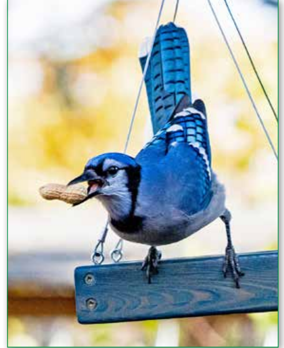
A blue jay departs from a feeder with his freshly acquired peanut.