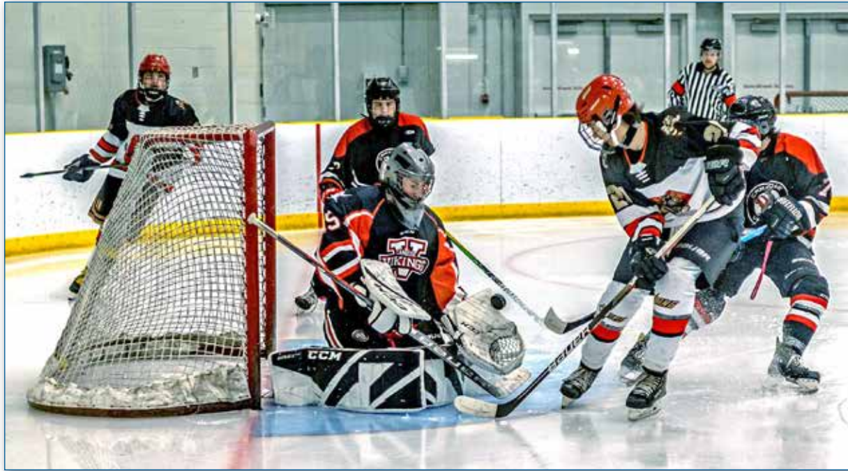
The Sturgeon U18AA Sting played the Camrose Vikings on Saturday, October 15 in Morinville, ending the day with a 4-1 loss. The Sting play TRAC Wolverines on the road this Saturday, October 29.