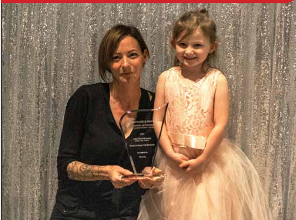
Home-Based Business - Rentz & Rover Pet Services - Stephen Dafoe Photo See the article at page 3