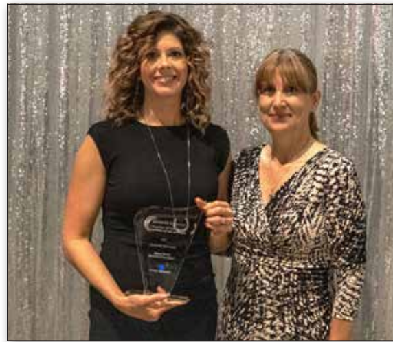
Community Spirit - Jessica Martel Memorial Foundation