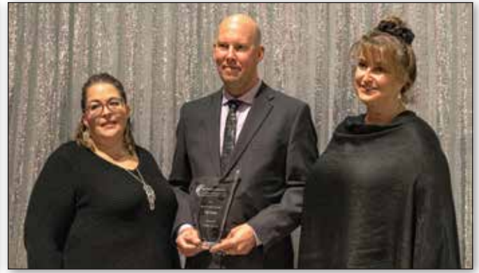
Agricultural - FABA Canada