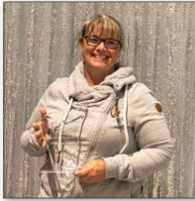
Medium Business - RT Septic Systems Inc