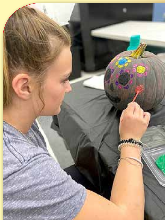
Thanks to everyone who came out to the Town of Legal's Pumpkin Paint night last week! We had a great time and it was great to see so many families enjoying themselves. Thank you for making it such a success!