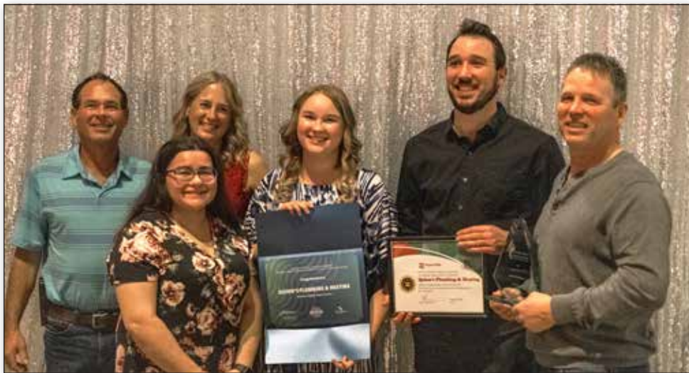
Legacy - Quinns Plumbing & Heating