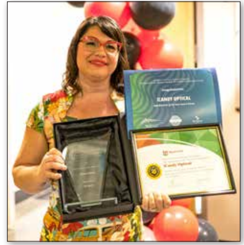
New Business - iCandy Optical

featured three nominees: RT Septic & Water Systems, Wolf Creek Building Supplies Morinville Ltd., and Jiffy Lube #1046. RT Septic & Water Systems Inc., was this year's recipient. The Sturgeon County business has seen its business grow from 20 to 30 systems a year to more than 100.