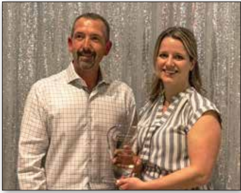
Large Business - NAPA Morinville