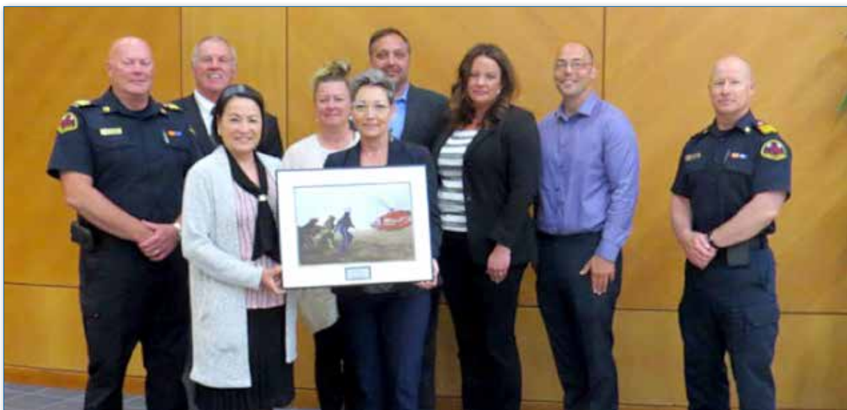
Today Council received a presentation from @STARSAirAmbulance during the June 14 Committee of the Whole Meeting. Council was also presented with a framed photo and plaque recognizing Sturgeon County's 15 years of supporting STARS.