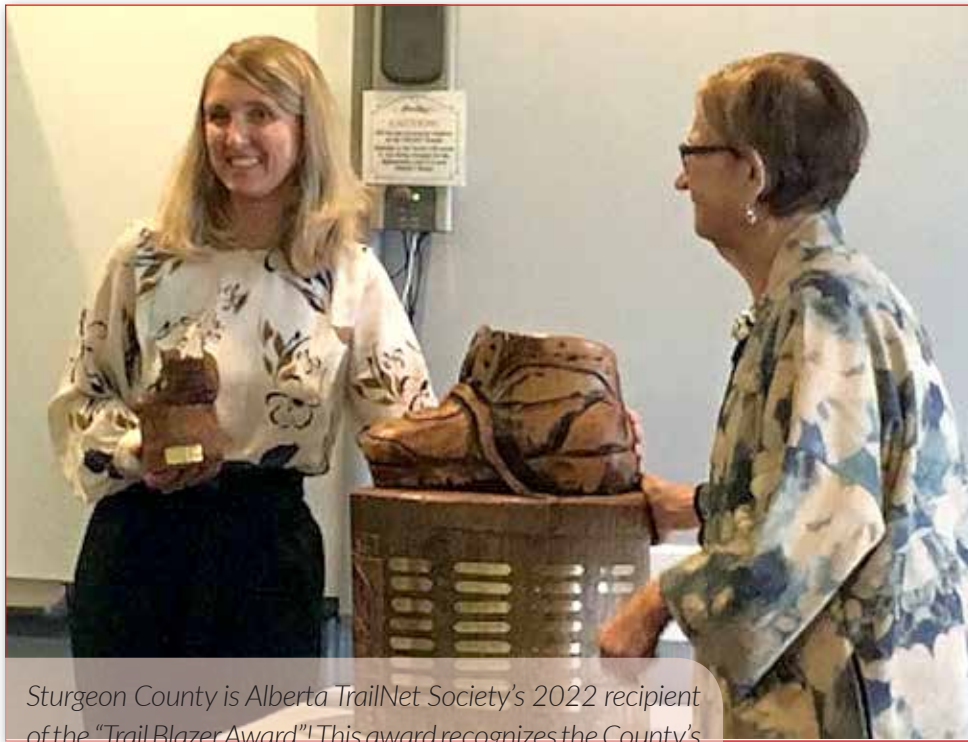
Sturgeon County is Alberta TrailNet Society's 2022 recipient of the "Trail Blazer Award"! This award recognizes the County's involvement in the development of trails; both in the County and other areas in the region. Find out more about the award and the County's work to promote a trail network connecting all Albertans here https://bit.ly/3MSdnOu .

For more information or to register for the Break Free 5/10k Run & Walk, please visit https://jessicamartelmemorialfoundation.com/break-free-run/ .