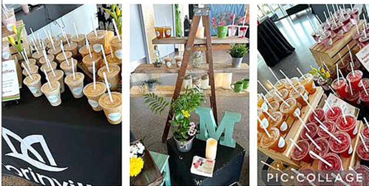
We were proud to welcome 140 regional colleagues to Morinville for the Edmonton Metropolitan Region Board Welcome to the Region session! It was an excellent day of learnings. This dedication of the EMRB to move our region forward is inspiring!