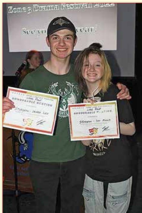
Sturgeon Composite High School drama festival students proudly display awards they received.