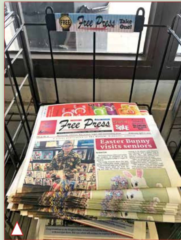
Pick up your copy of the Free Press today! Available in Morinville every Wednesday at the following stores: Sobeys, Petro Canada 9504 100 Street, Shell at 10609 100 Avenue, Shell at 9154 100 Street and Circle K at 9106 200 Avenue.