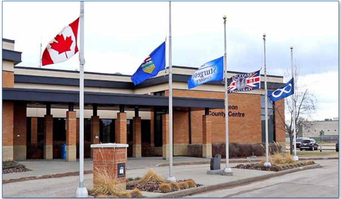
Flags were a half-mast at the Sturgeon County offices and other facilities across Canada on April 28 to mark the Day of Mourning. The annual remembrance honours workers who were killed, injured or suffered illness as a result of work-related incidents. According to the Worker Compensation Board of Alberta, 178 people were lost in 2021 due to work-place injury or illness.

“When we as a society take steps to support our Reservists, we help ensure the dedicated men and women of our military can support us. This bill will provide an opportunity to further their military training and develop transferable skills that enhance the workplace.”