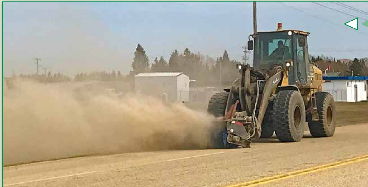
This tractor with street sweeping equipment was driving on Highway 28 West of Bon Accord on April 25 during winds that gusted up to 50 km/hr.